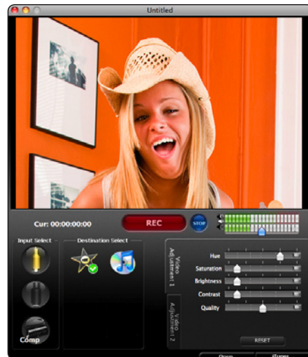
ADVCmini Capture Application.

Other products use inferior 2D technology resulting in loss of detail and false colors: see the “rainbow effect” on the left hand side of the image above. ADVCmini offers 3D Y/C separation, as used on professional and broadcast equipment, for superior capture quality.